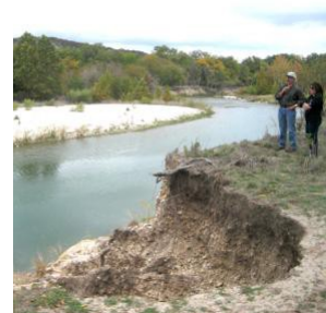
Members of the planning team assess a cutbank and a possible nearby location for the observation tower to overlook the South Llano River.

The conservation demonstration areas will consist of best management practices for land and water resource protection, conservation and restoration. Construction will begin in Fall of 2013. This effort was made possible through support by National Park Service Rivers, Trails and Conservation Assistance Program; Texas Parks and Wildlife Department Guadalupe Bass Restoration Initiative and Landowner Incentive Program; and the Dixon Water Founda-